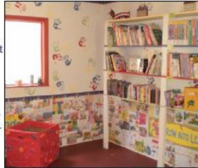
The children's book area at My One School

there are about one billion non-literate adults in the world today. This is approximately 26 percent of the world's adult population.